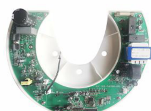
MPPT water heating controller