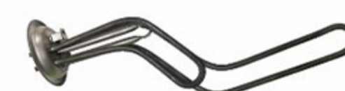
AC/DC heating element